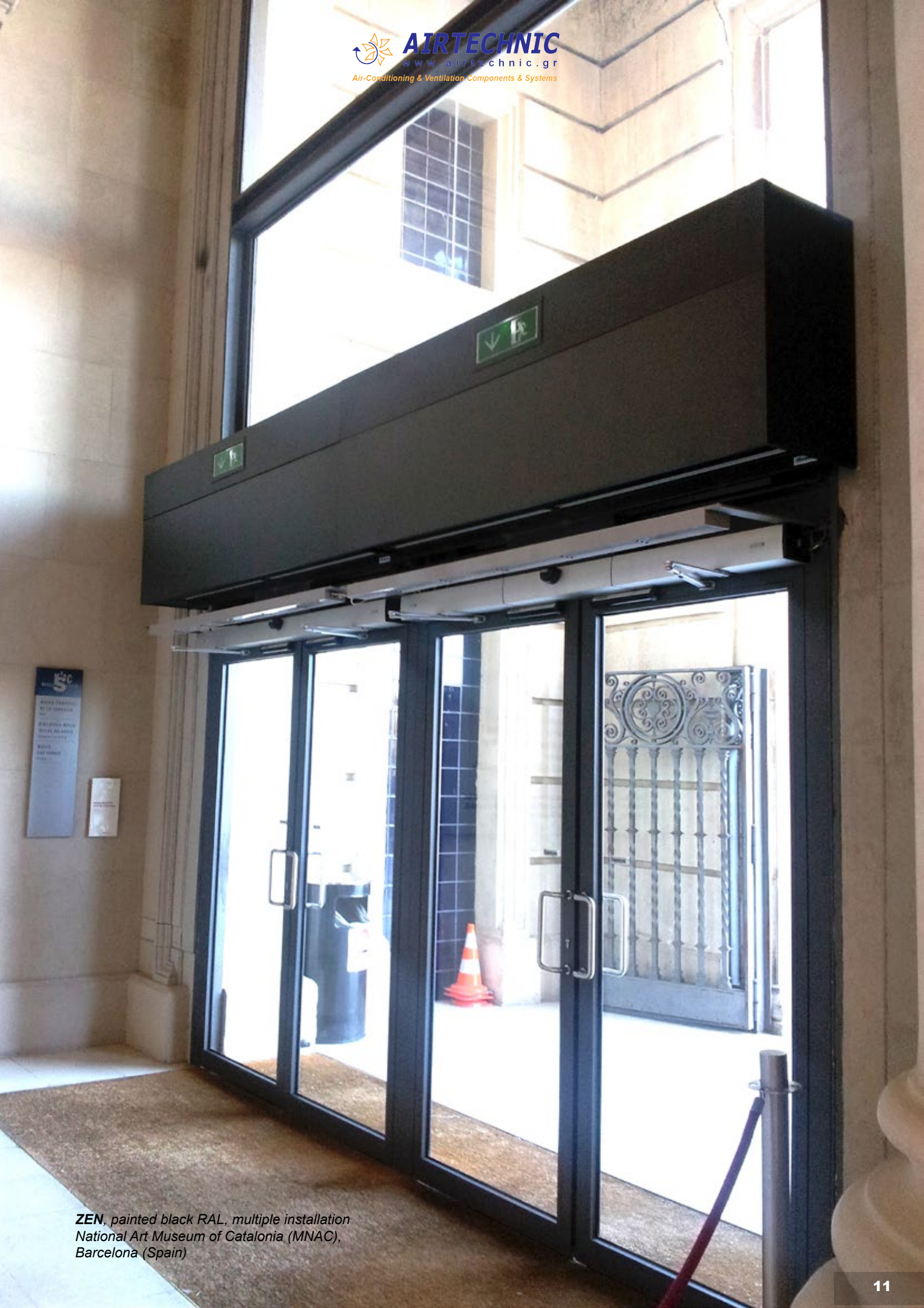
ZEN , painted black RAL, multiple installation National Art Museum of Catalonia (MNAC), Barcelona (Spain)