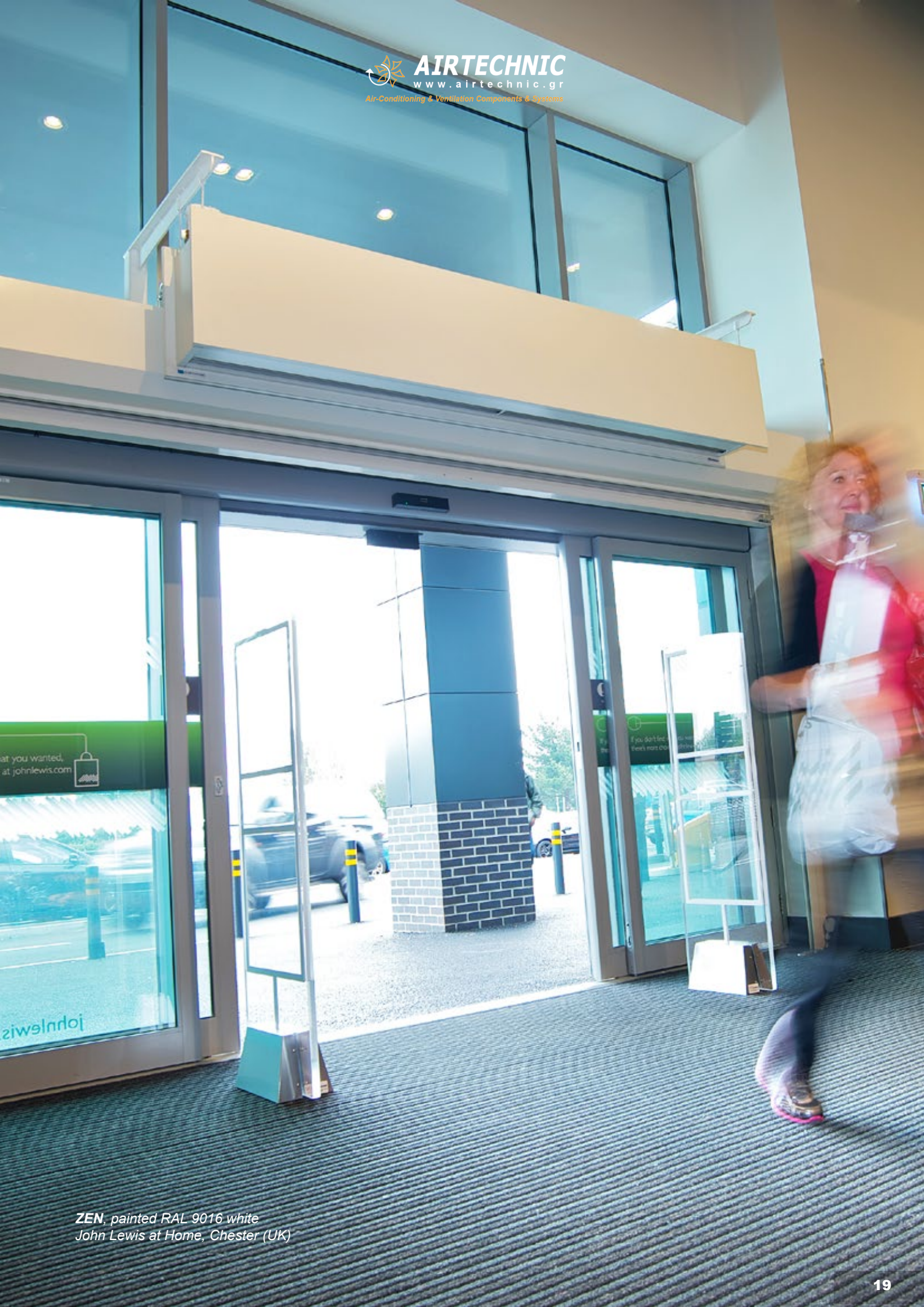
ZEN , painted RAL 9016 white John Lewis at Home, Chester (UK)