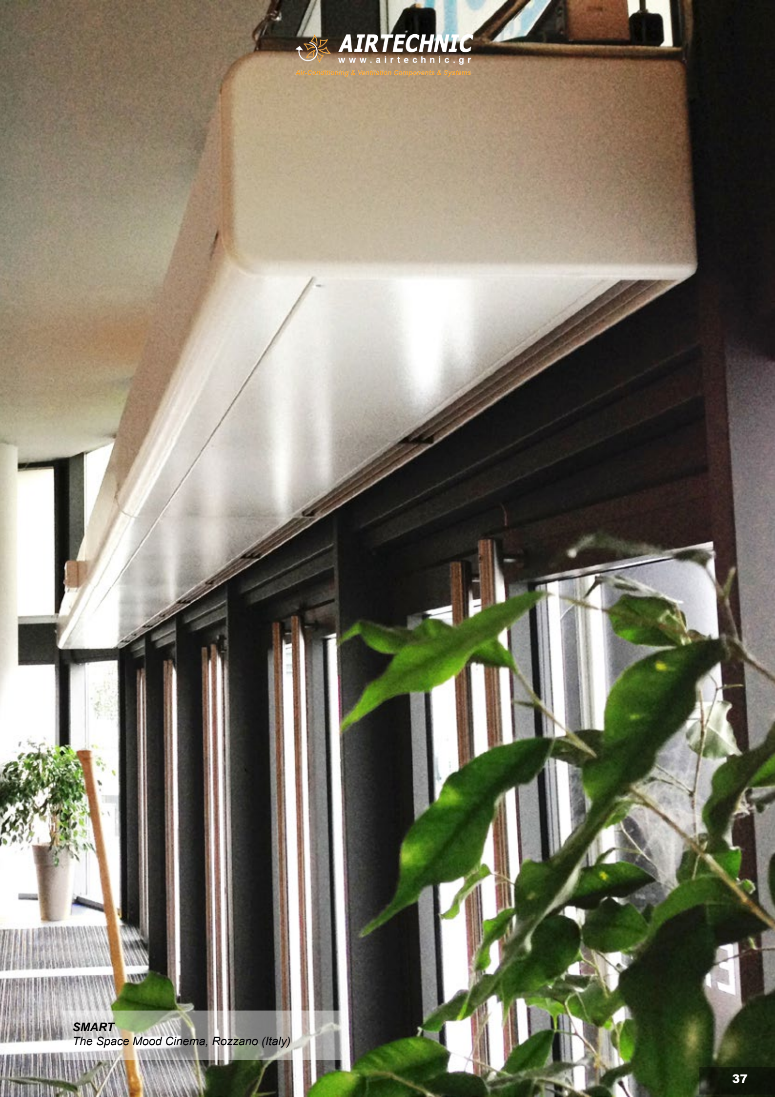
SMART The Space Mood Cinema, Rozzano (Italy)