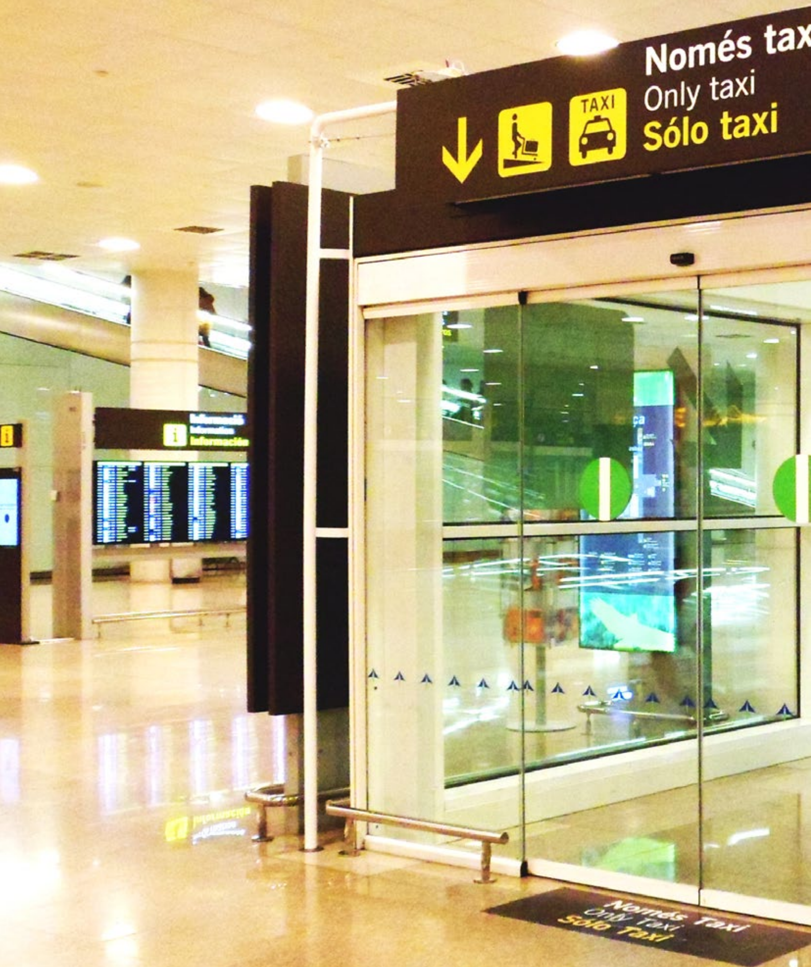
ZEN , black painted RAL and vinyl signage El Prat Airport, Barcelona (Spain)