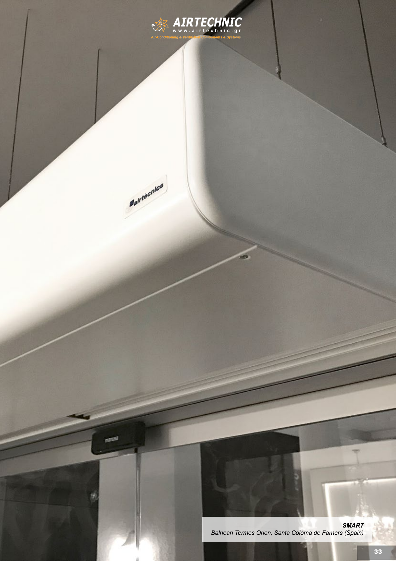
SMART Balneari Termes Orion, Santa Coloma de Farners (Spain)