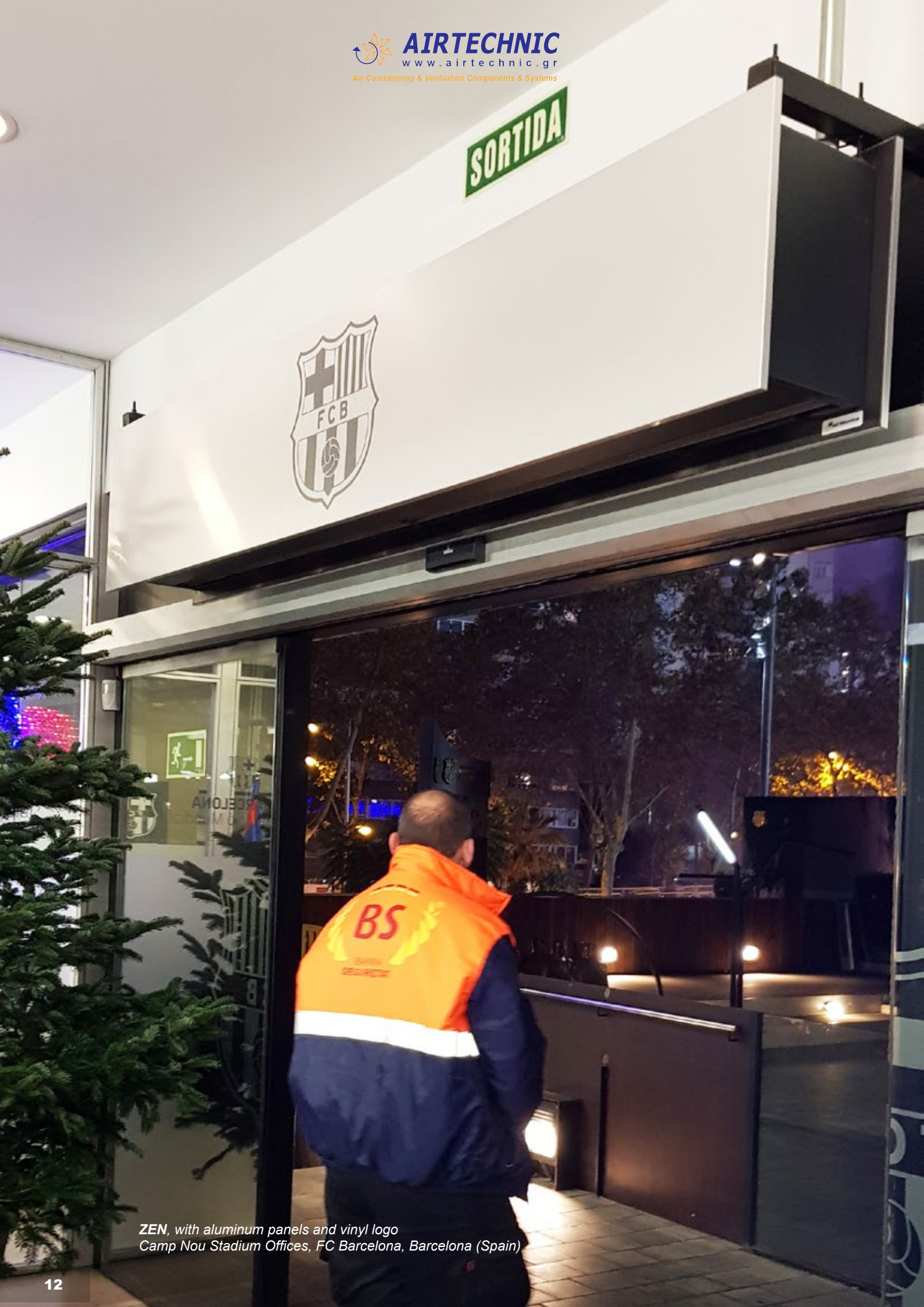
ZEN, with aluminum panels and vinyl logo Camp Nou Stadium Offices, FC Barcelona, Barcelona (Spain)