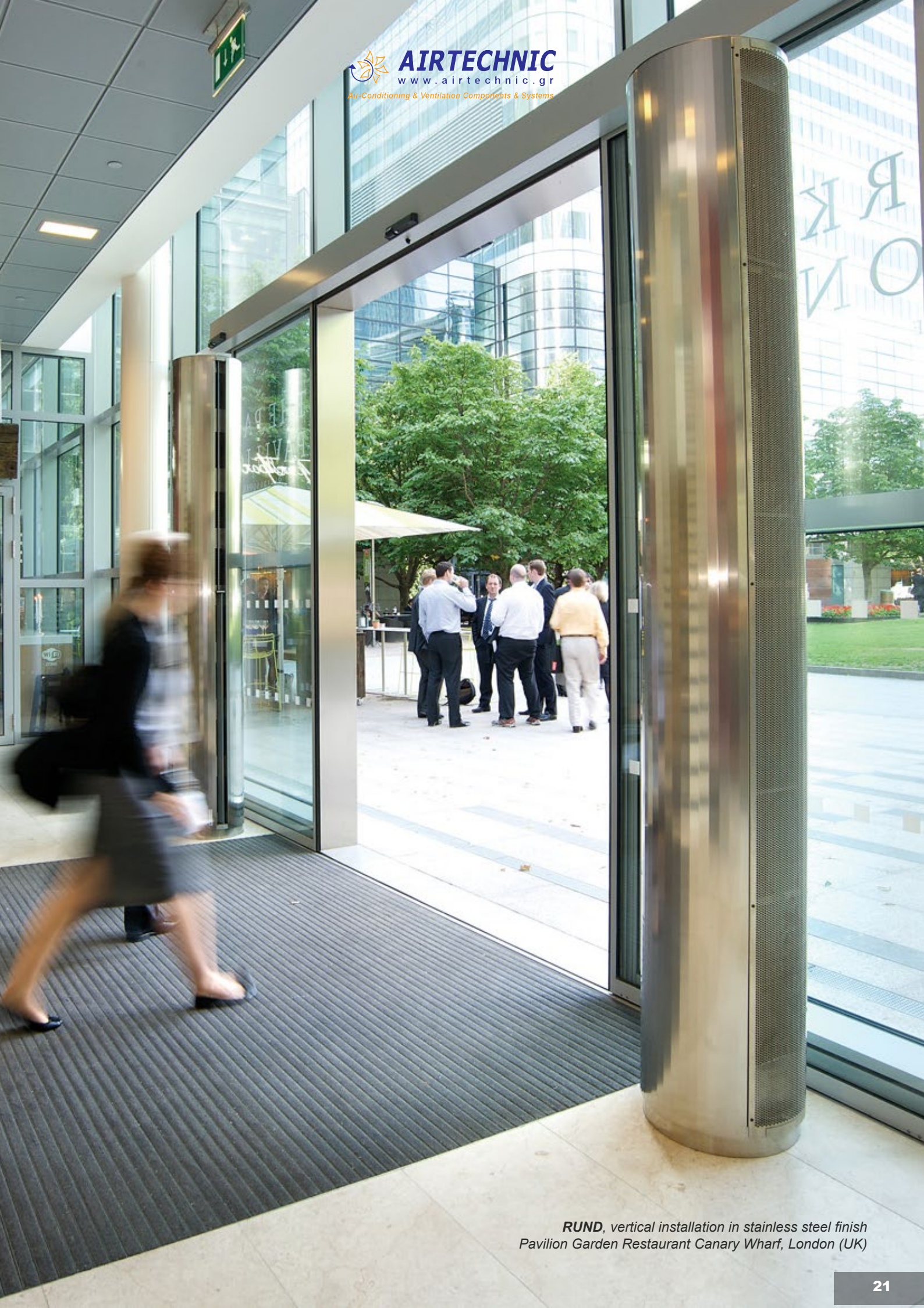
RUND , vertical installation in stainless steel finish Pavilion Garden Restaurant Canary Wharf, London (UK)