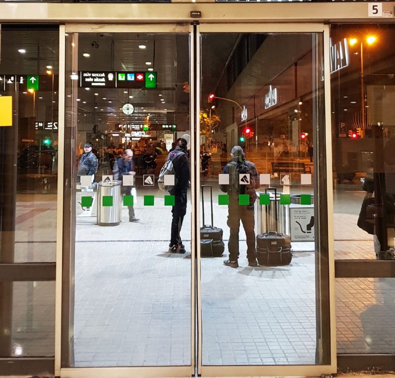
ZEN, with multiple signs Sants train station, Barcelona (Spain)