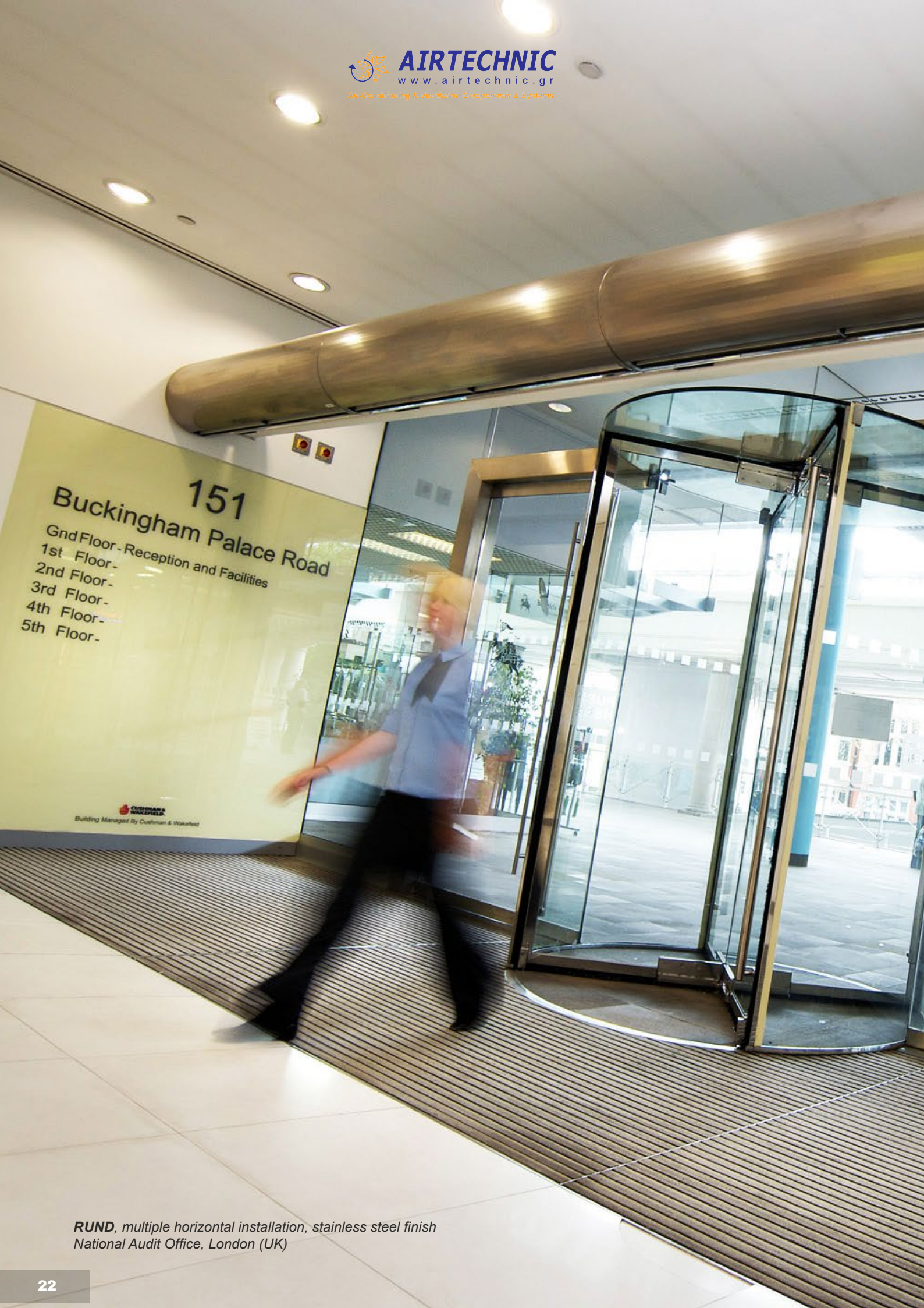
RUND , multiple horizontal installation, stainless steel finish National Audit Office, London (UK)