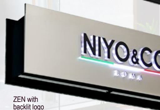
ZEN with backlit logo