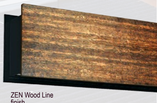
ZEN Wood Line finish