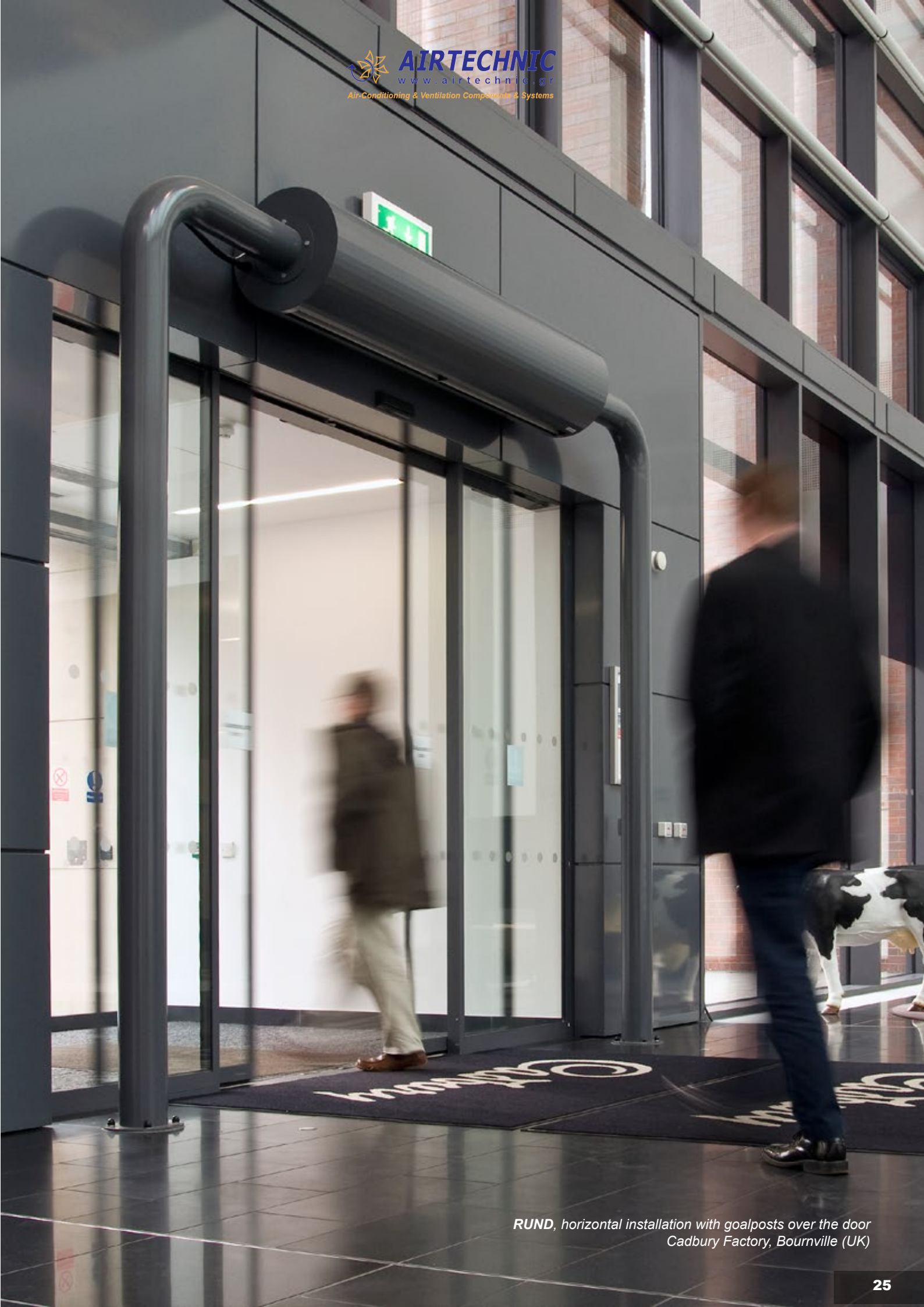
RUND , horizontal installation with goalposts over the door Cadbury Factory, Bournville (UK)