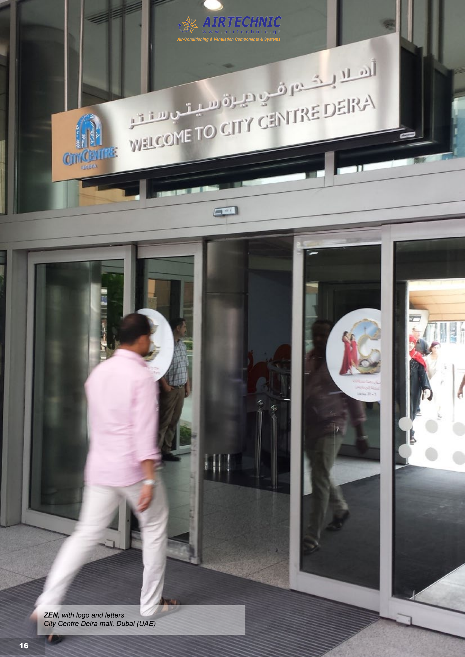
ZEN , with logo and letters City Centre Deira mall, Dubai (UAE)