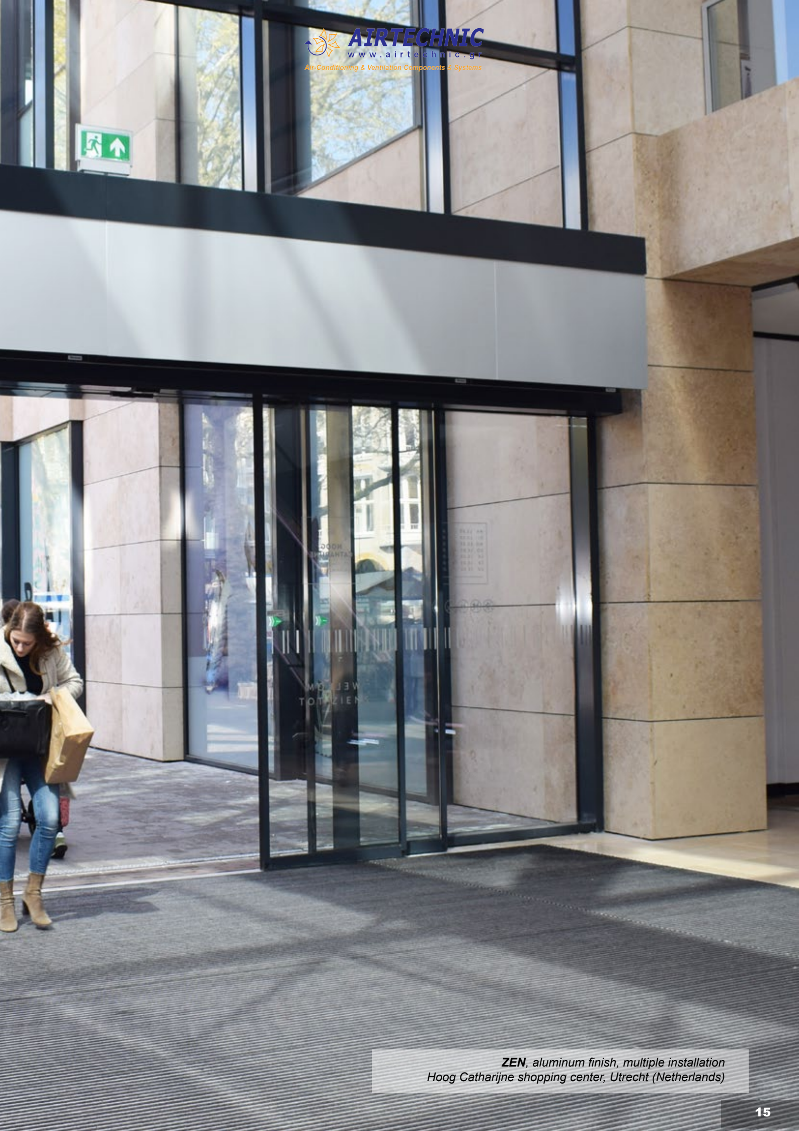
ZEN , aluminum finish, multiple installation Hoog Catharijne shopping center, Utrecht (Netherlands)