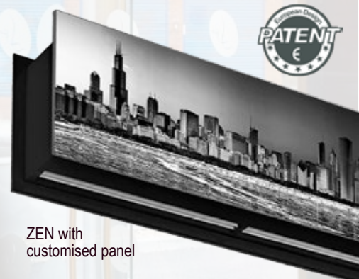
ZEN with customised panel