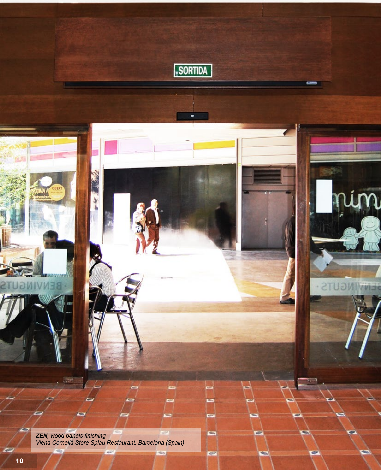
ZEN , wood panels finishing Viena Cornellà Store Splau Restaurant, Barcelona (Spain)