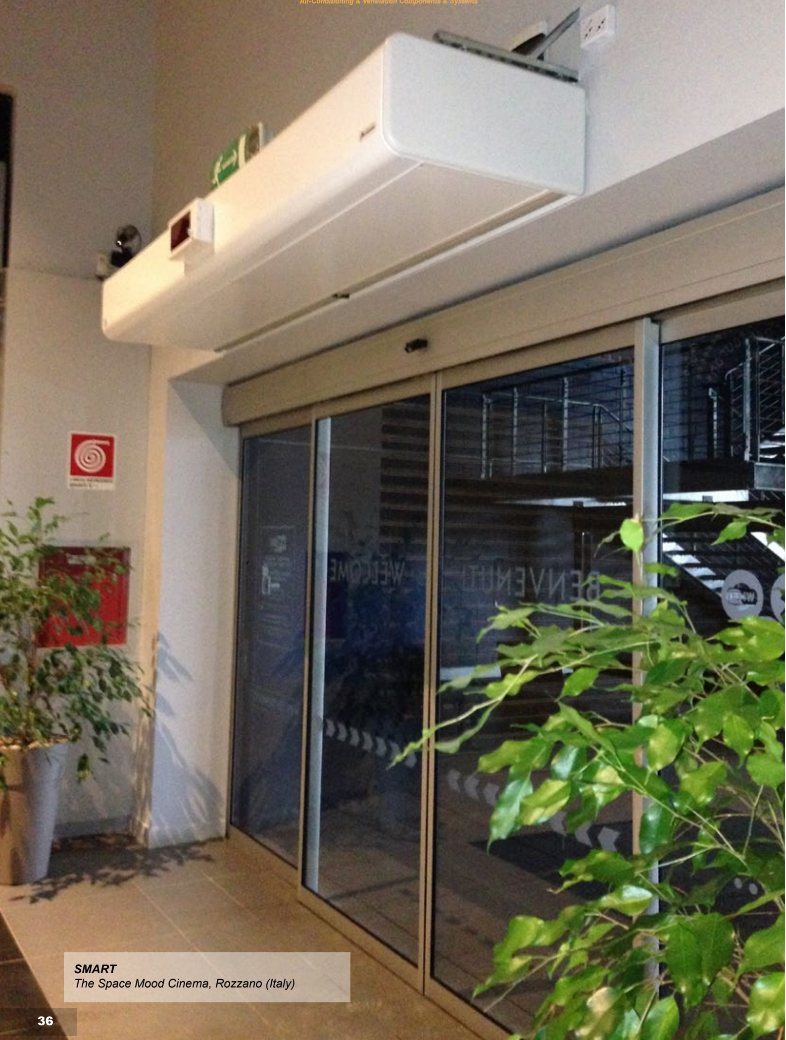
SMART The Space Mood Cinema, Rozzano (Italy)