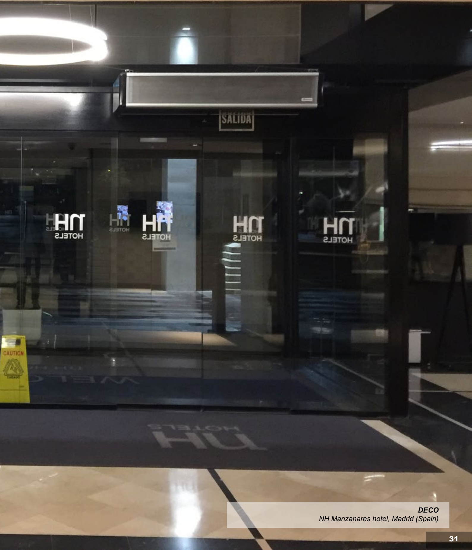
DECO NH Manzanares hotel, Madrid (Spain)