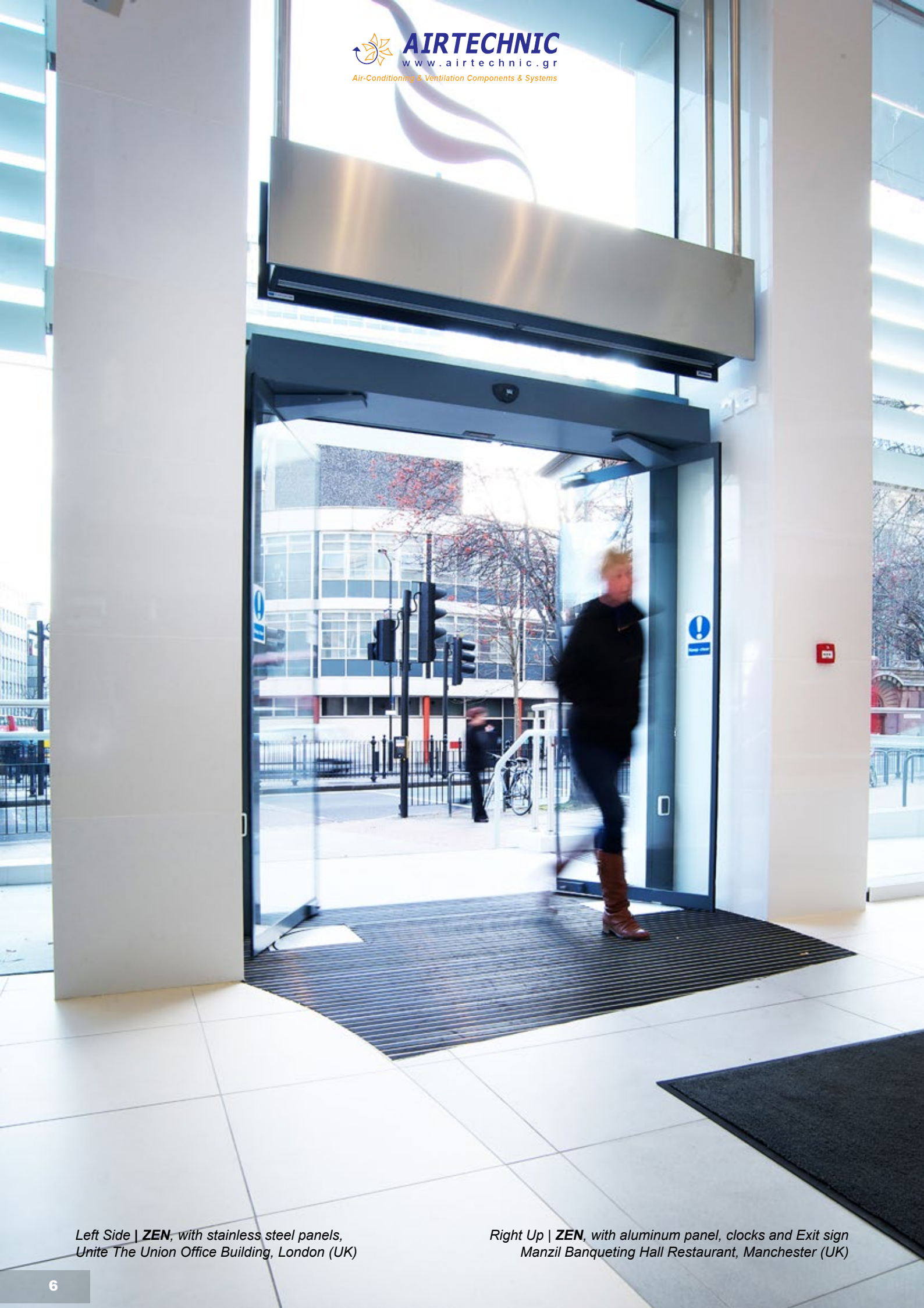
Left Side | ZEN , with stainless steel panels, Unite The Union Office Building, London (UK)