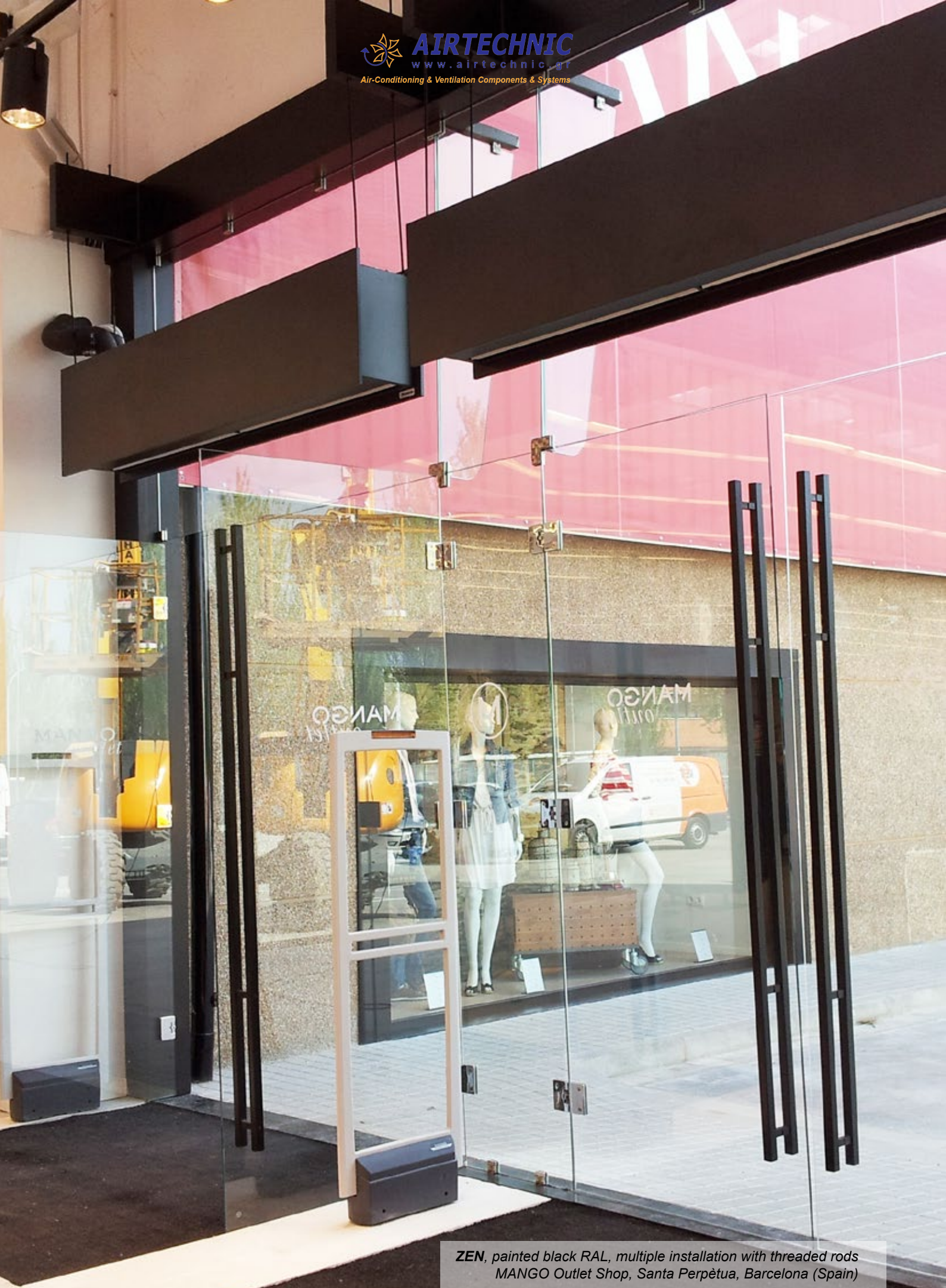
ZEN , painted black RAL, multiple installation with threaded rods MANGO Outlet Shop, Santa Perpètua, Barcelona (Spain)