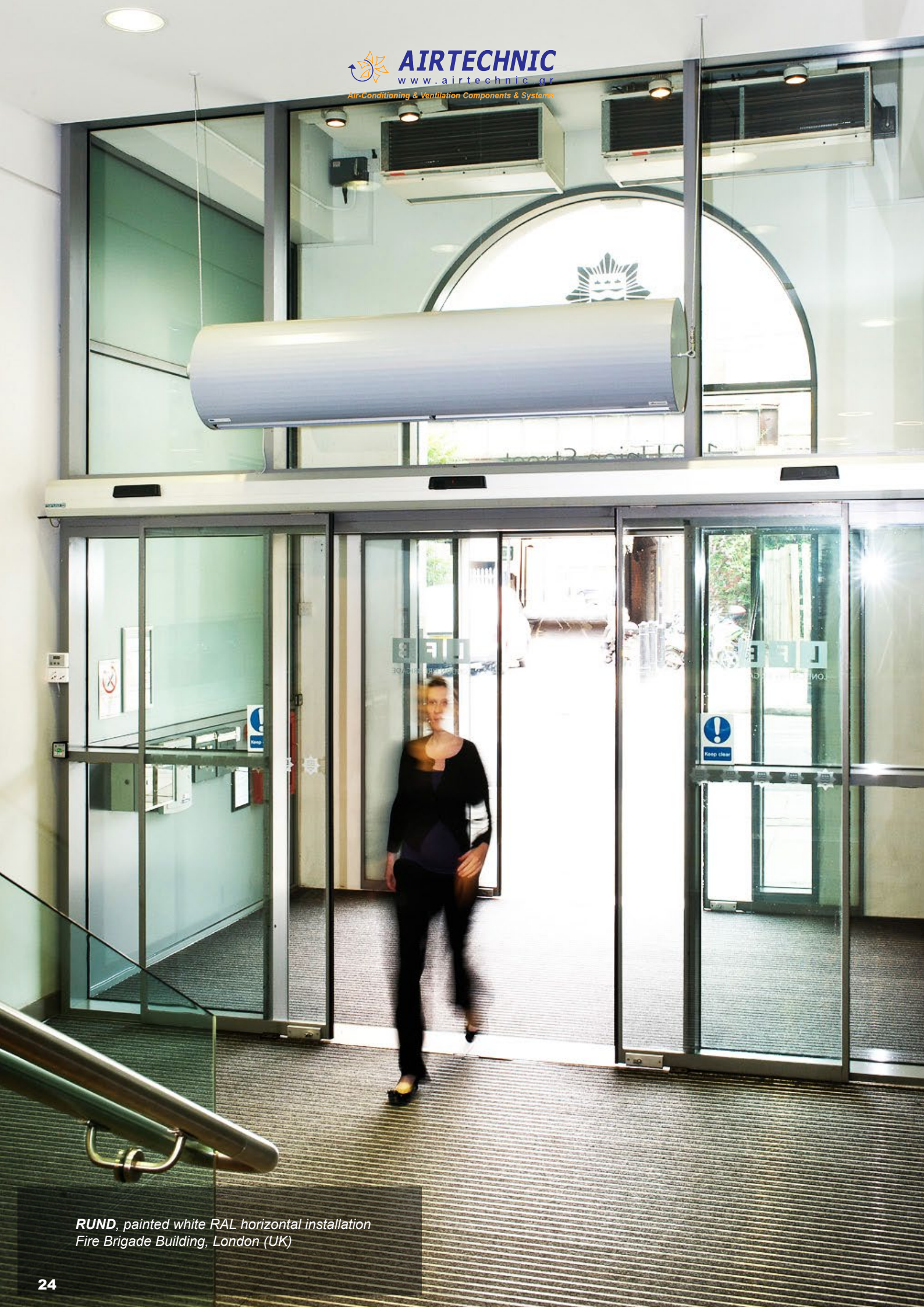
RUND, painted white RAL horizontal installation Fire Brigade Building, London (UK)