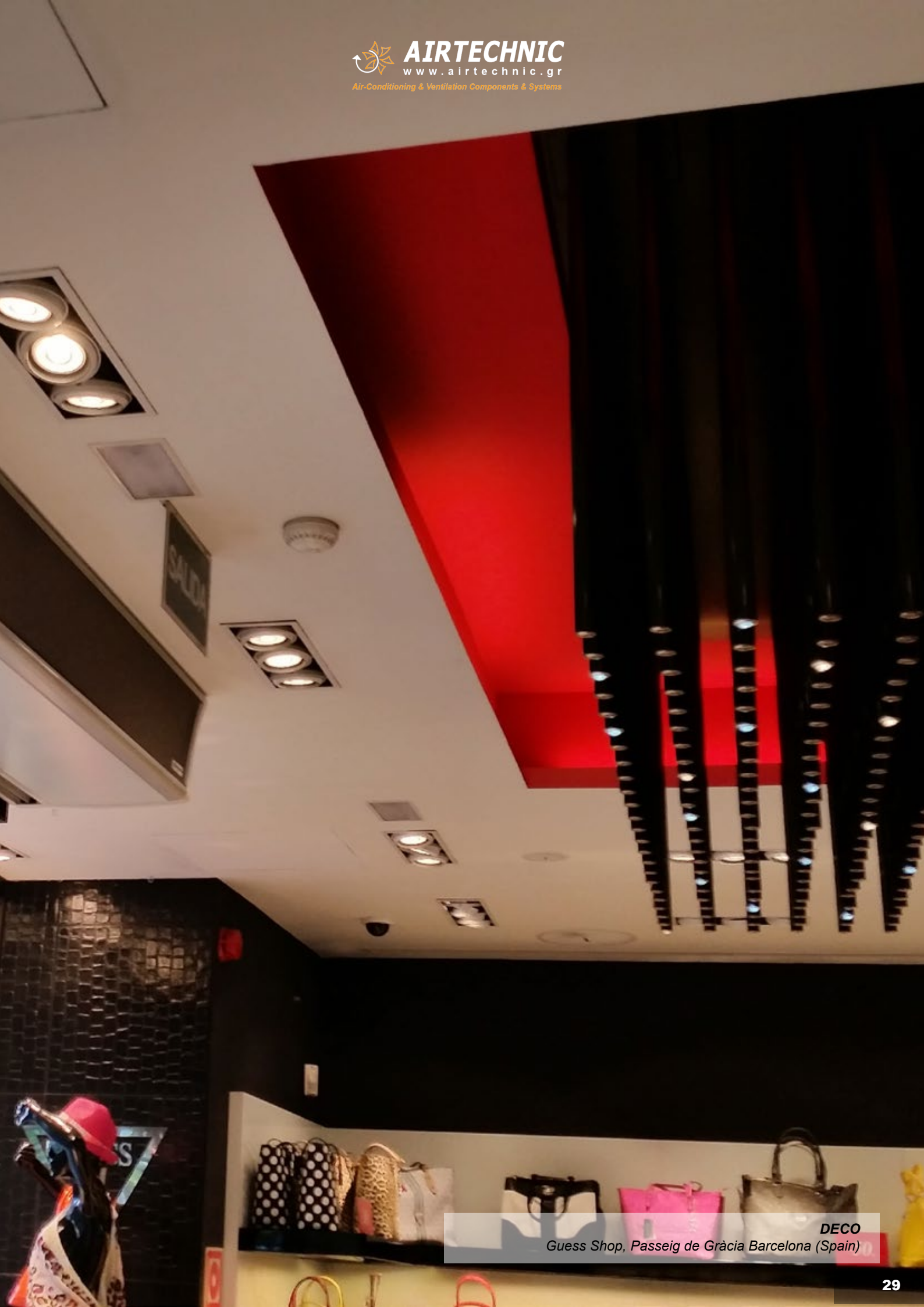
DECO Guess Shop, Passeig de Gràcia Barcelona (Spain)