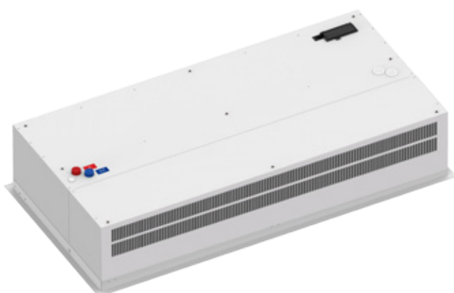
Detail of the upper area of the air curtain