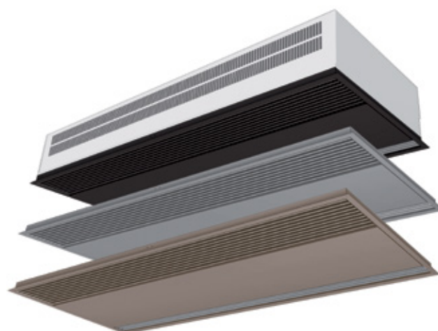
Customizable inlet grille in RAL color optionally