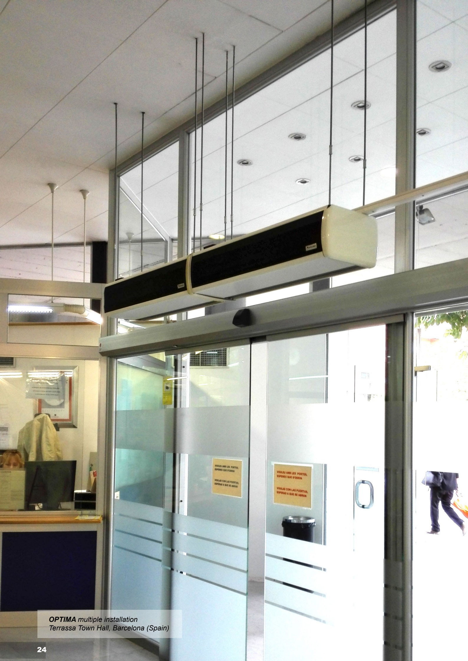
OPTIMA multiple installation Terrassa Town Hall, Barcelona (Spain)