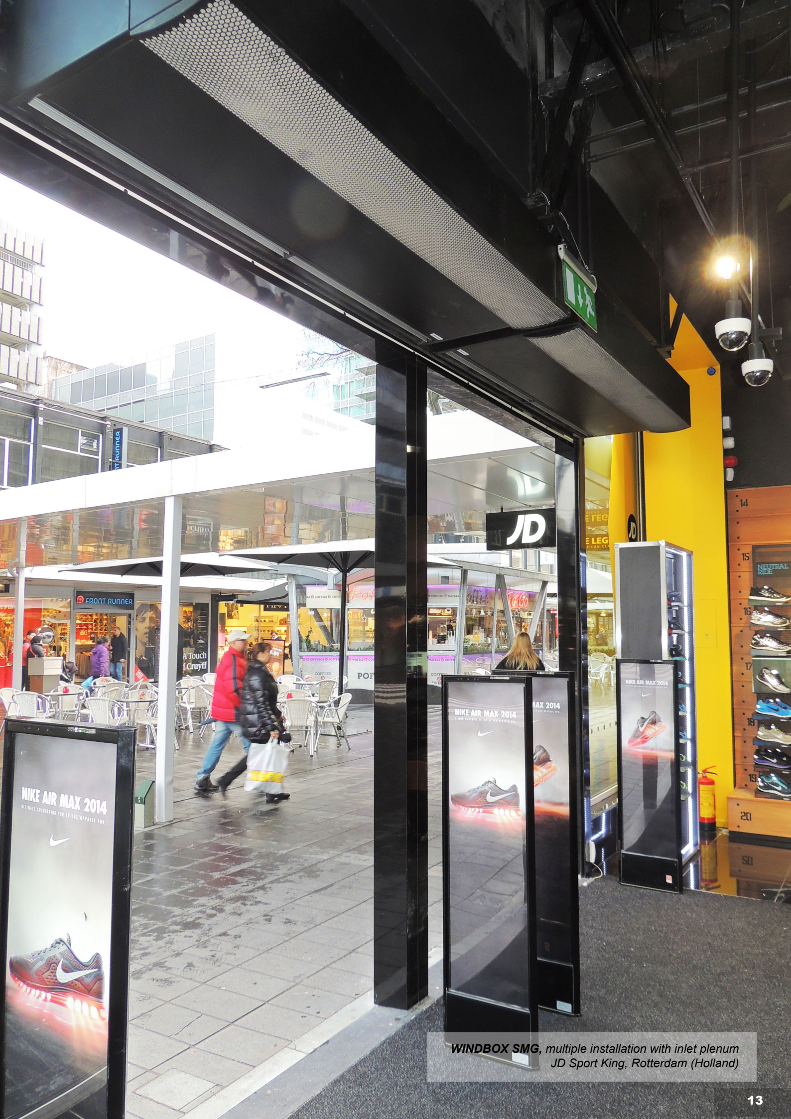
WINDBOX SMG , multiple installation with inlet plenum JD Sport King, Rotterdam (Holland)