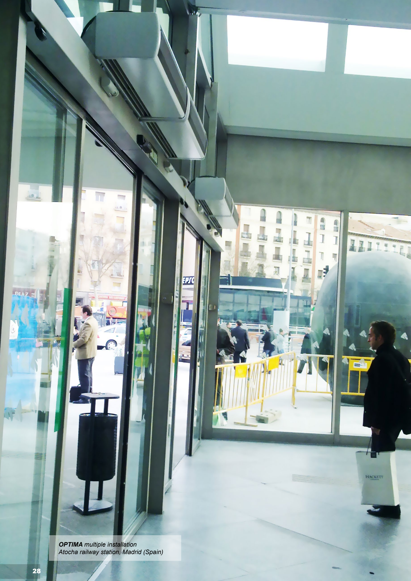
OPTIMA multiple installation Atocha railway station, Madrid (Spain)