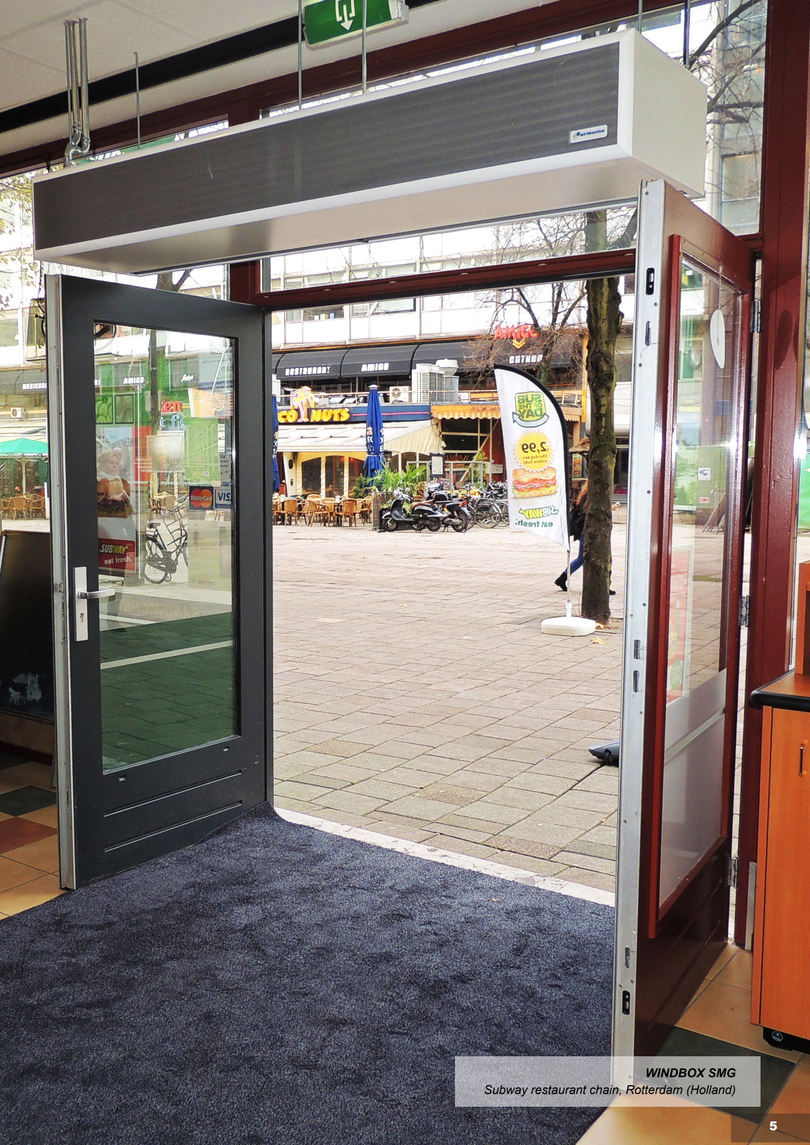
WINDBOX SMG Subway restaurant chain, Rotterdam (Holland)