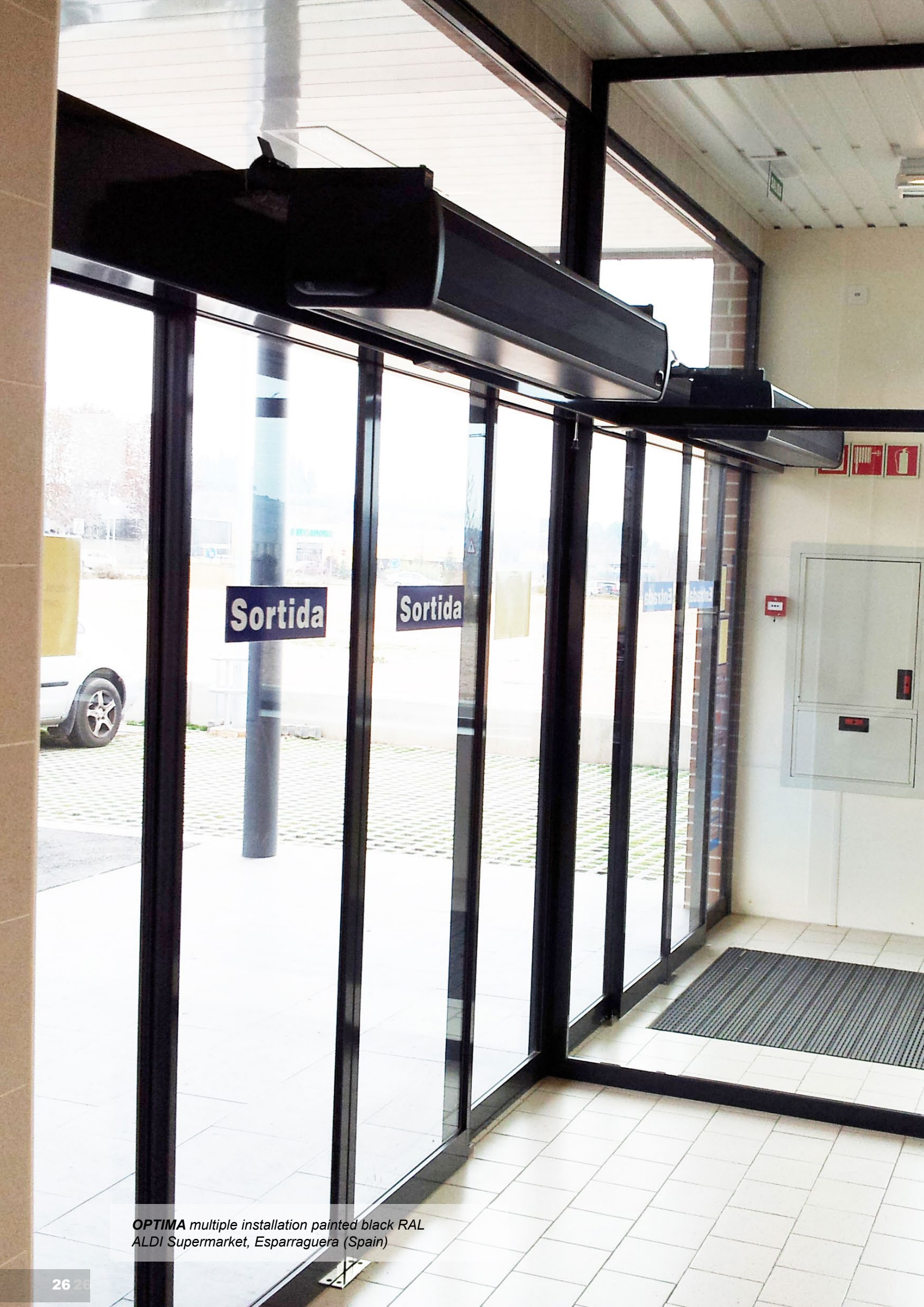
OPTIMA multiple installation painted black RAL ALDI Supermarket, Esparraguera (Spain)