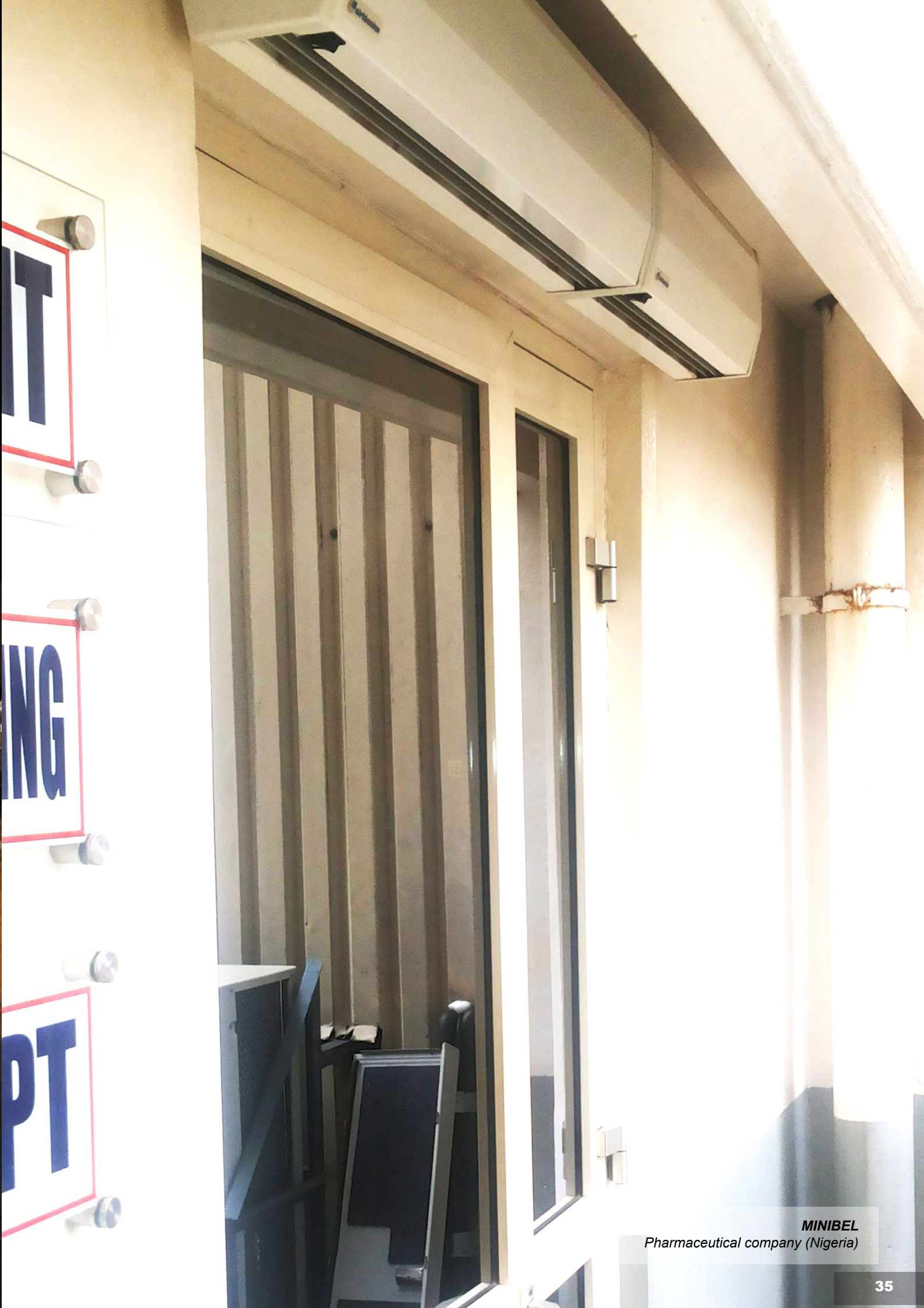
MINIBEL Pharmaceutical company (Nigeria)