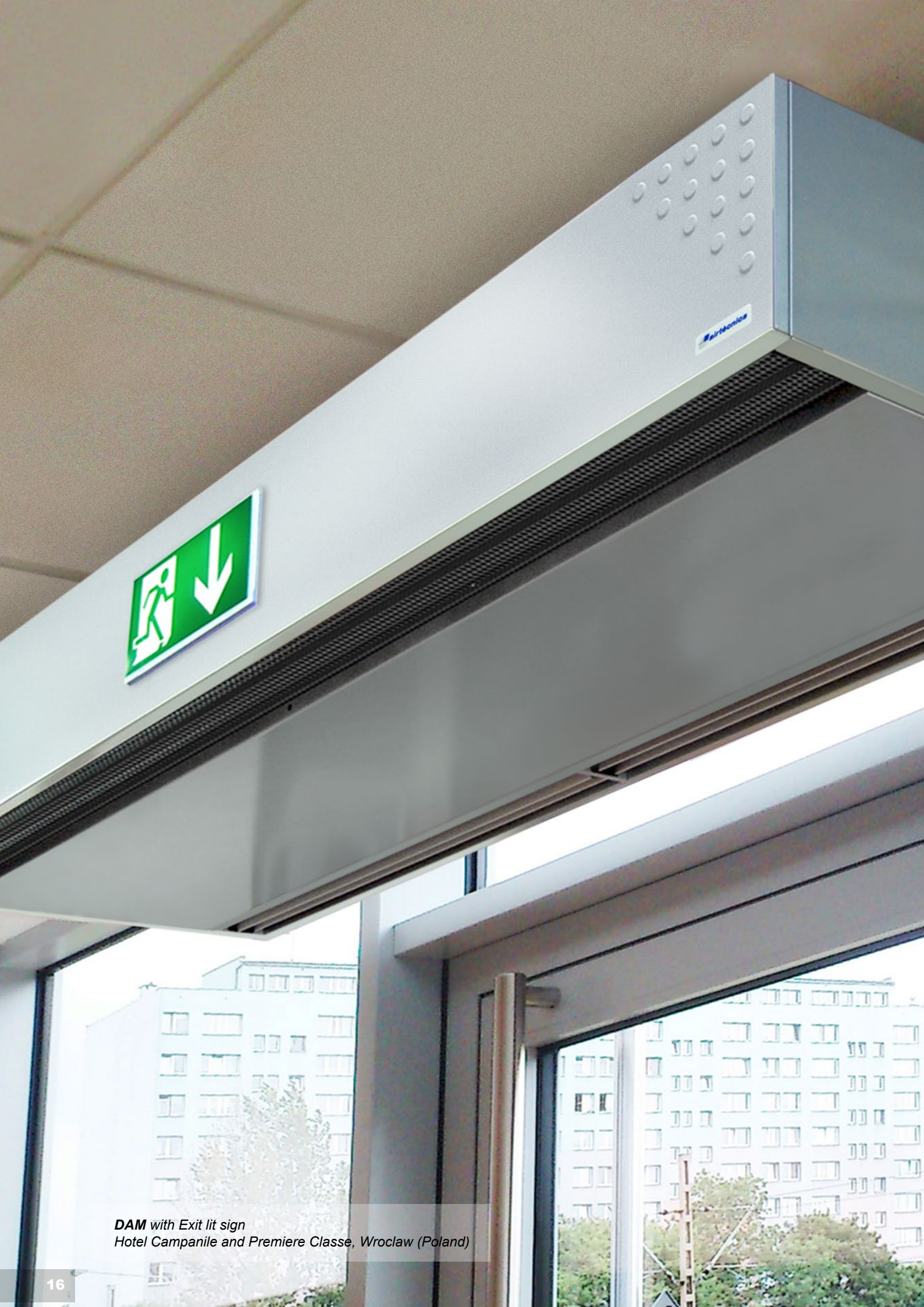
DAM with Exit lit sign Hotel Campanile and Premiere Classe, Wroclaw (Poland)