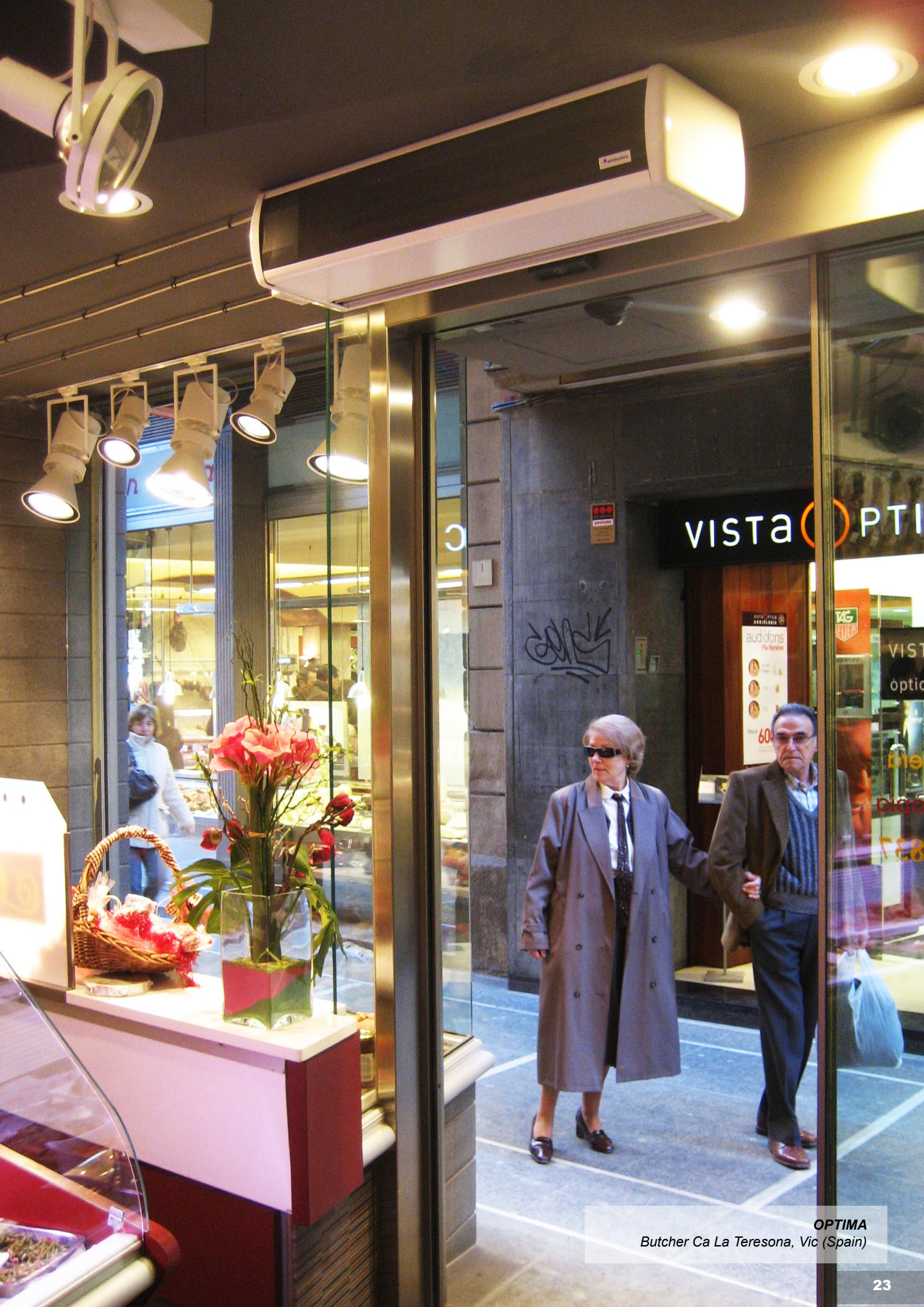
OPTIMA Butcher Ca La Teresona, Vic (Spain)