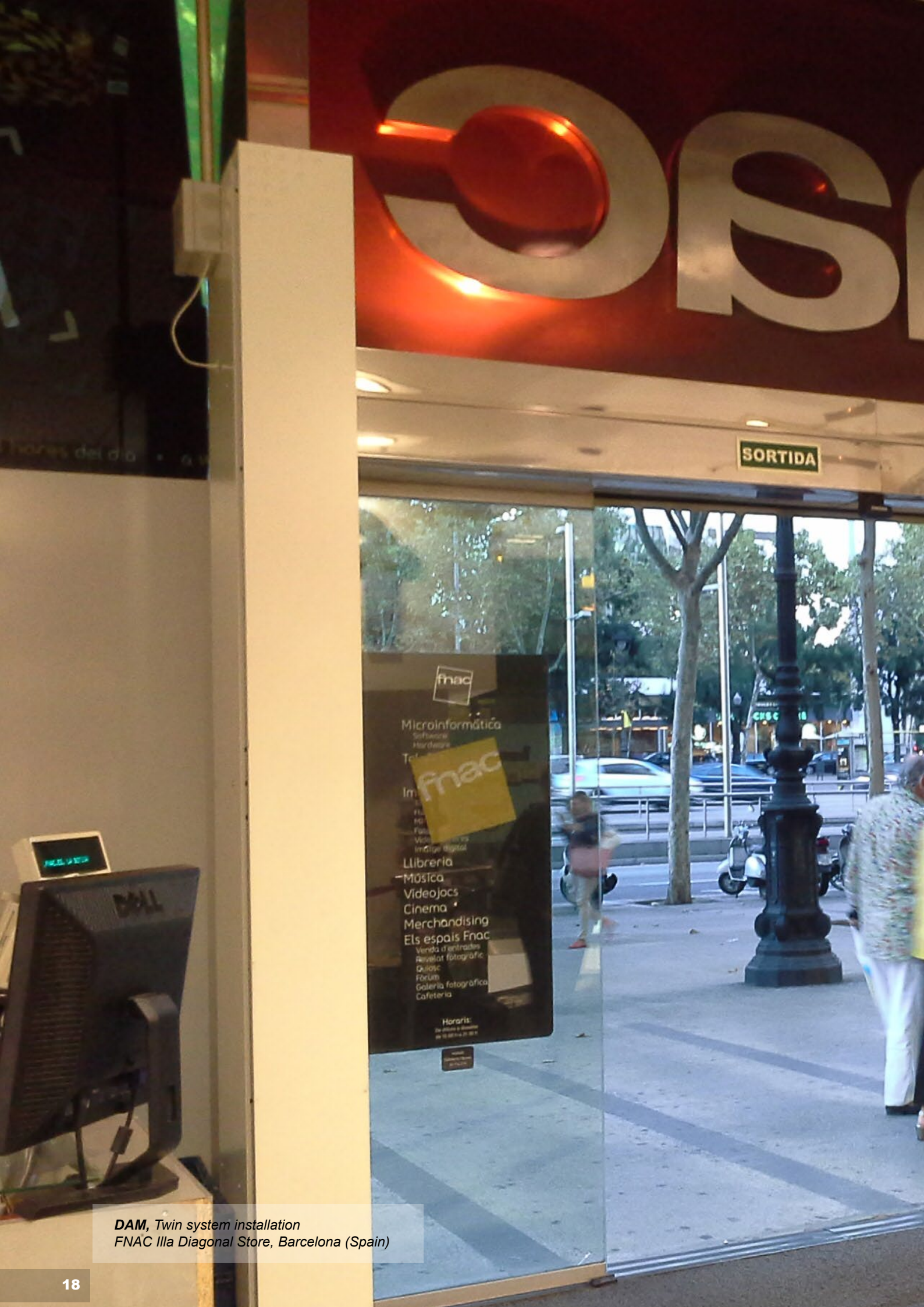
DAM, Twin system installation FNAC Illa Diagonal Store, Barcelona (Spain)