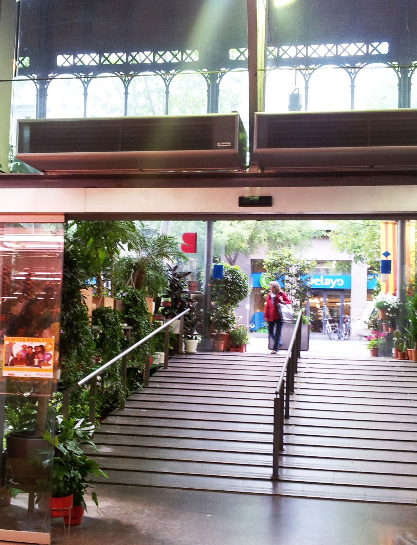
WINDBOX SMG, multiple installation Mercat de la Concepció, Barcelona (Spain)