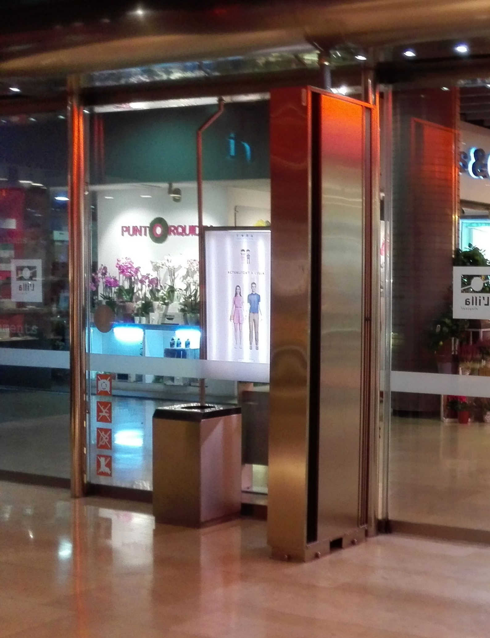
DAM, Twin system installation FNAC Illa Diagonal Store, Barcelona (Spain)