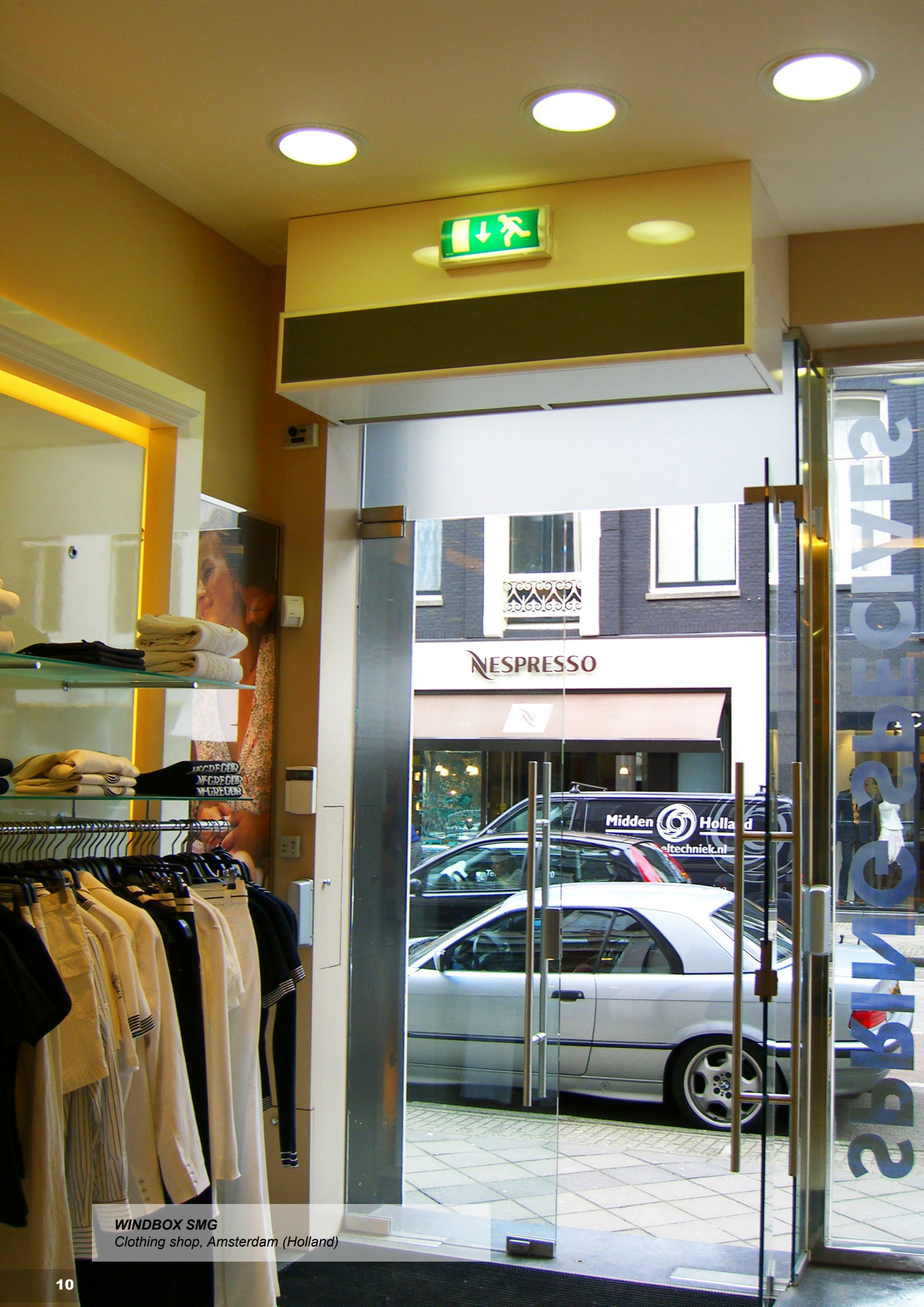
WINDBOX SMG Clothing shop, Amsterdam (Holland)