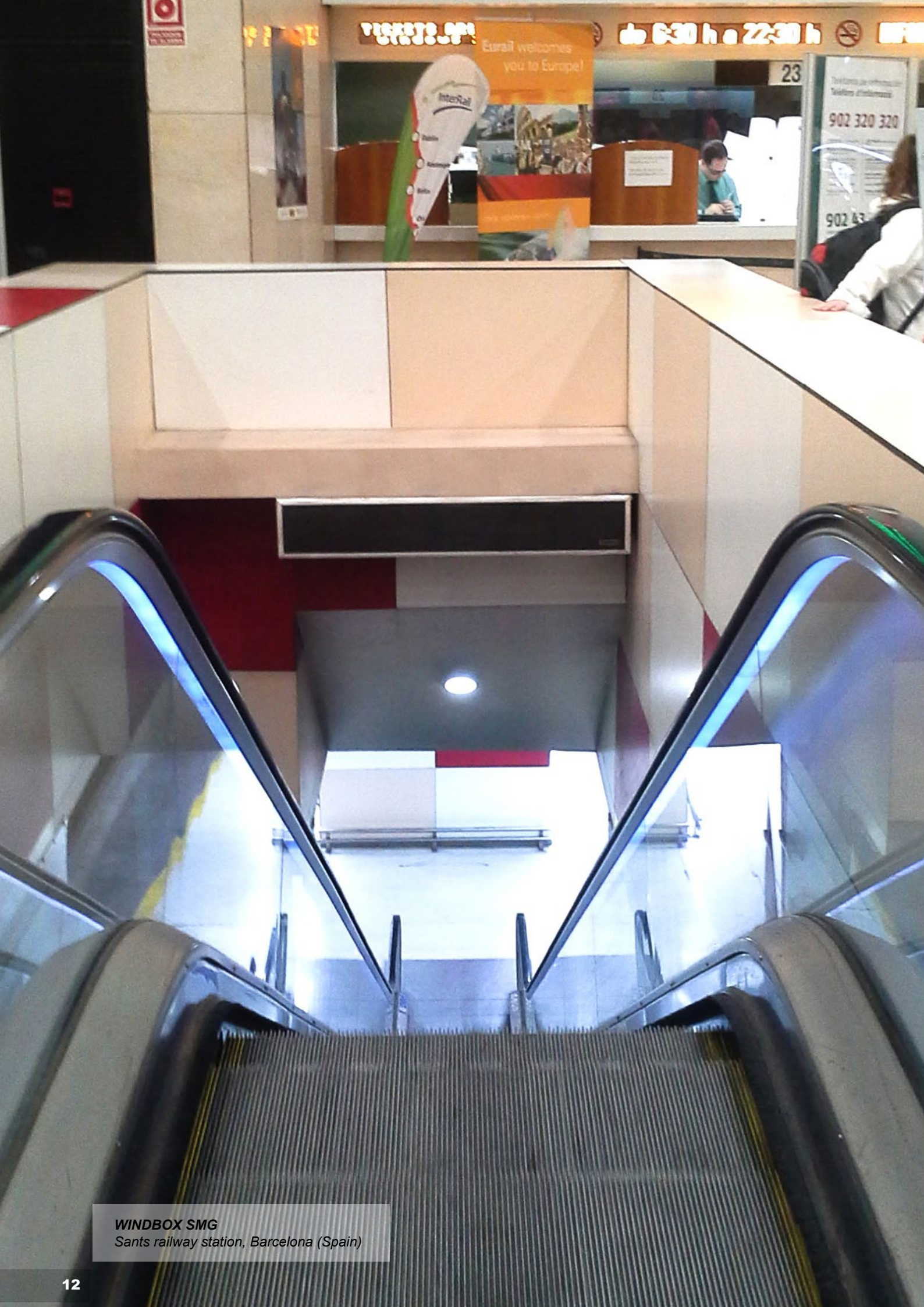
WINDBOX SMG Sants railway station, Barcelona (Spain)