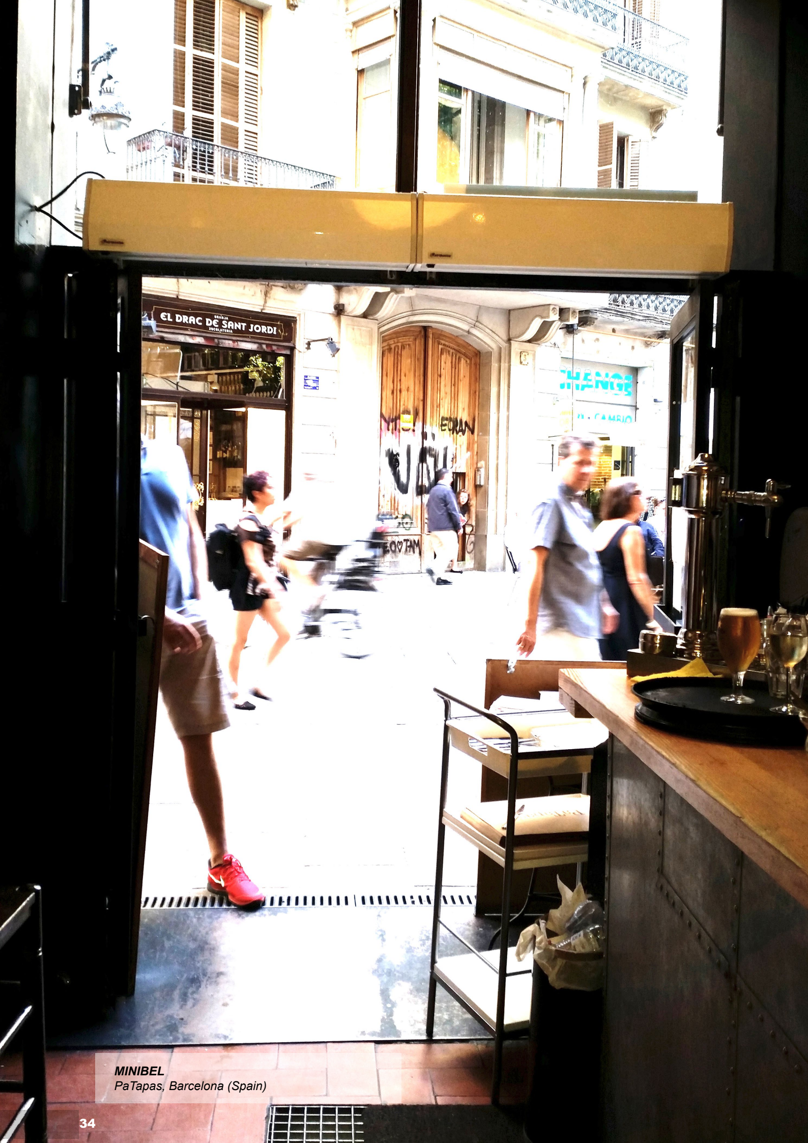
MINIBEL PaTapas, Barcelona (Spain)