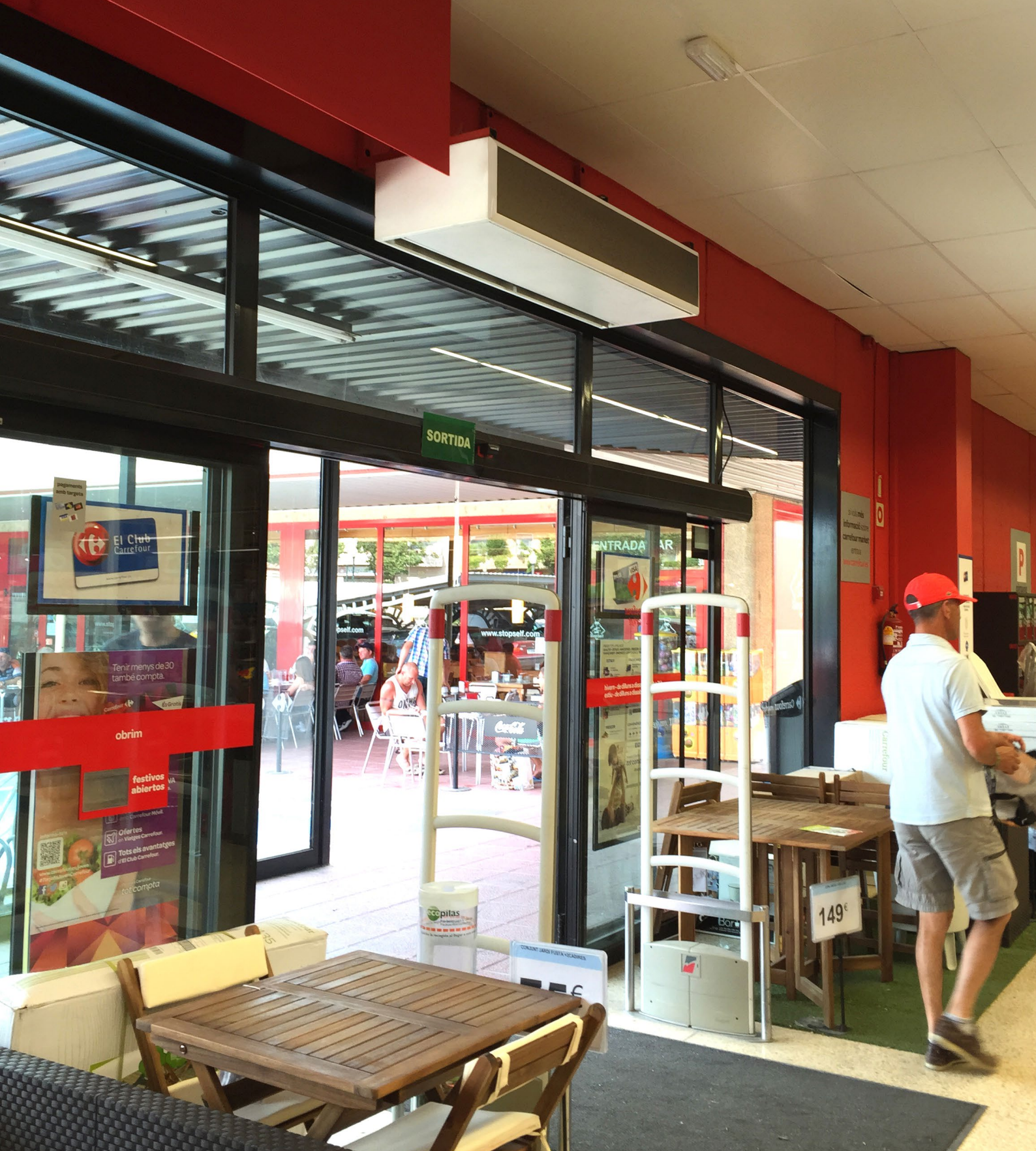
WINDBOX SMG CARREFOUR Supermarket, L'Estartit (Spain)