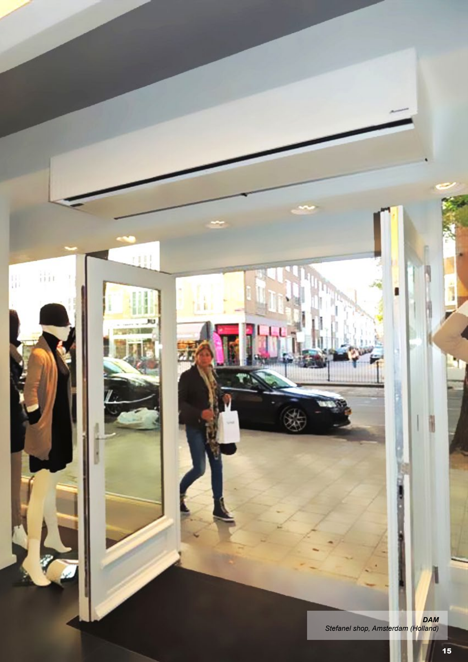
DAM Stefanel shop, Amsterdam (Holland)