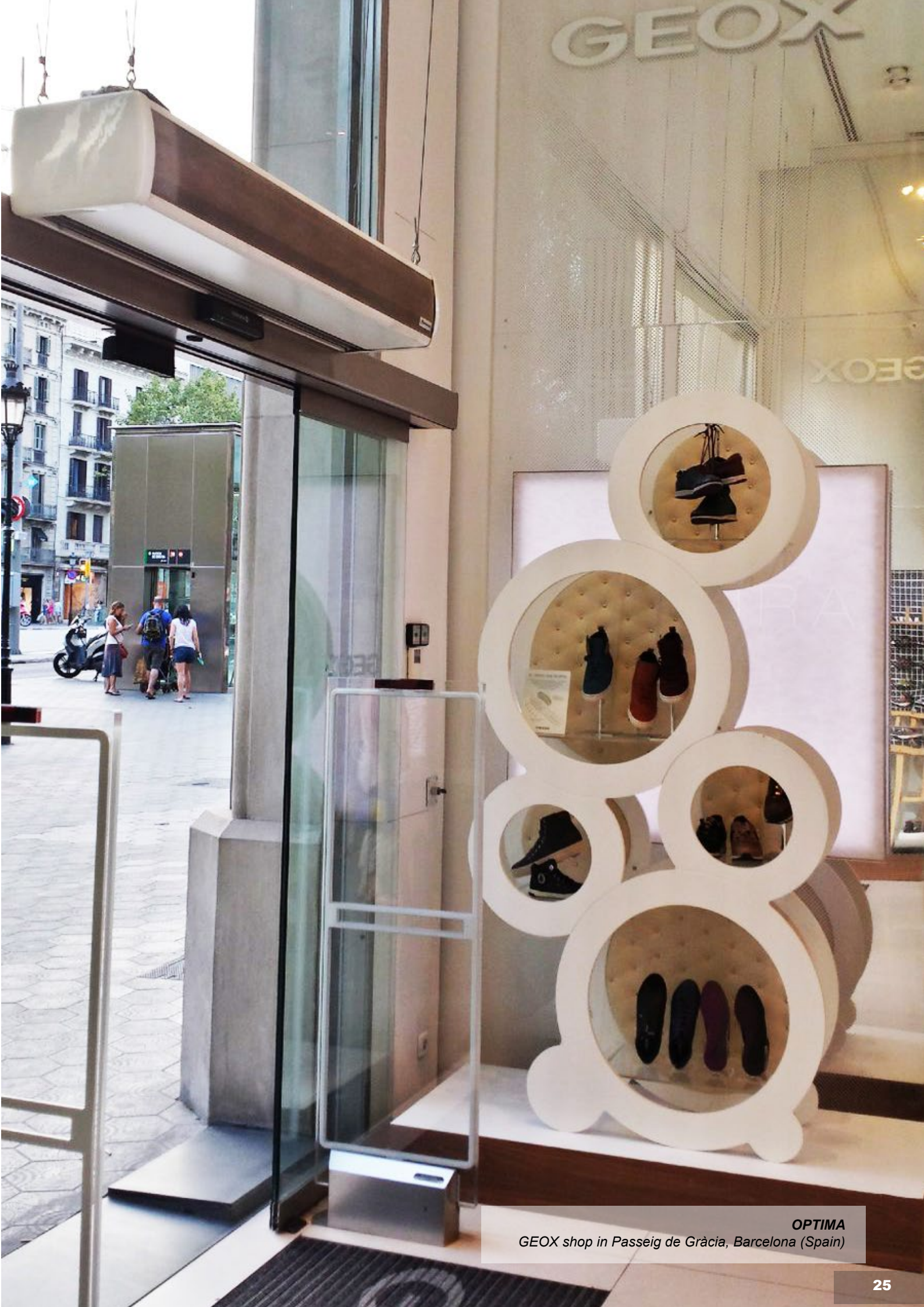
OPTIMA GEOX shop in Passeig de Gràcia, Barcelona (Spain)