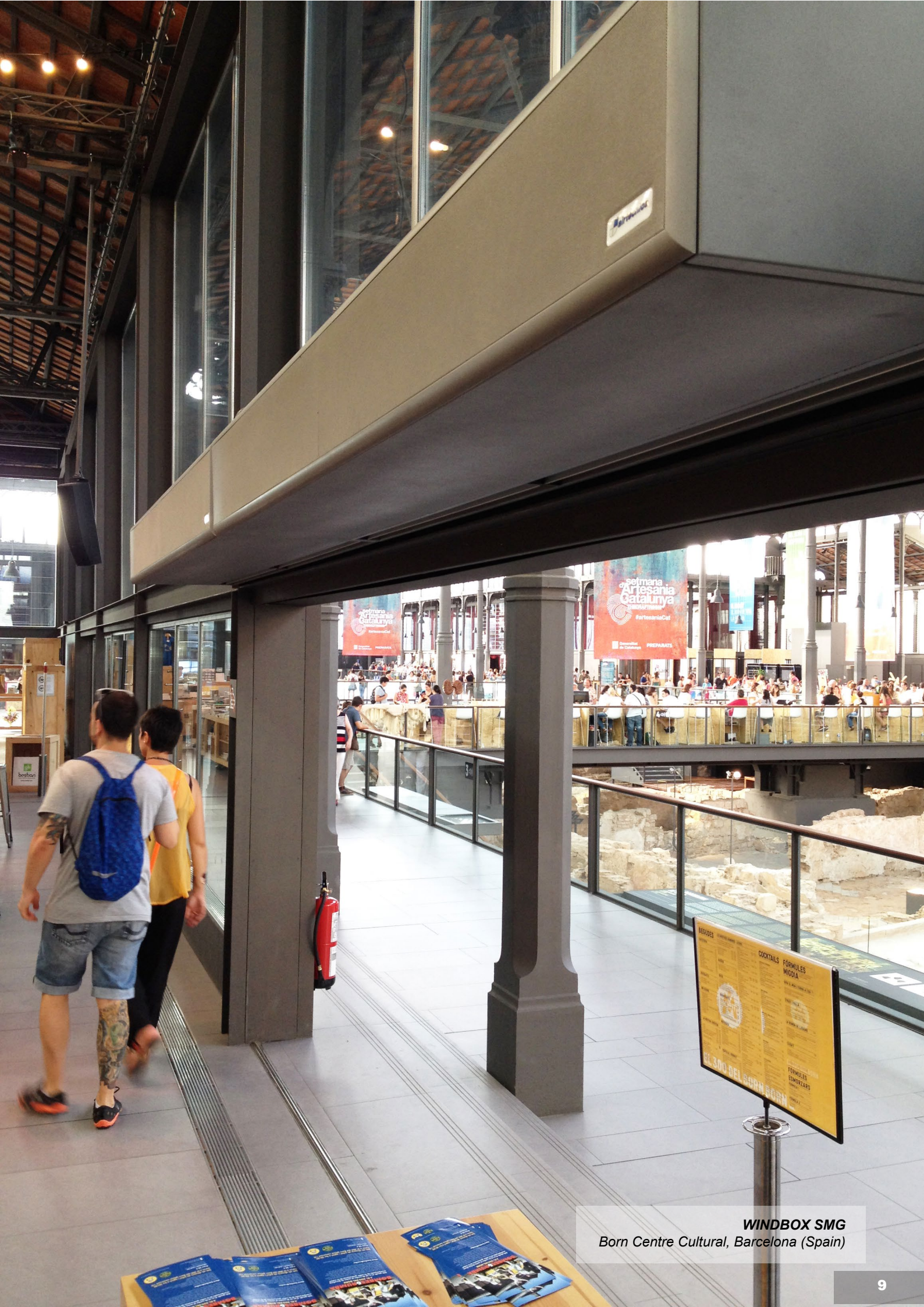
WINDBOX SMG Born Centre Cultural, Barcelona (Spain)