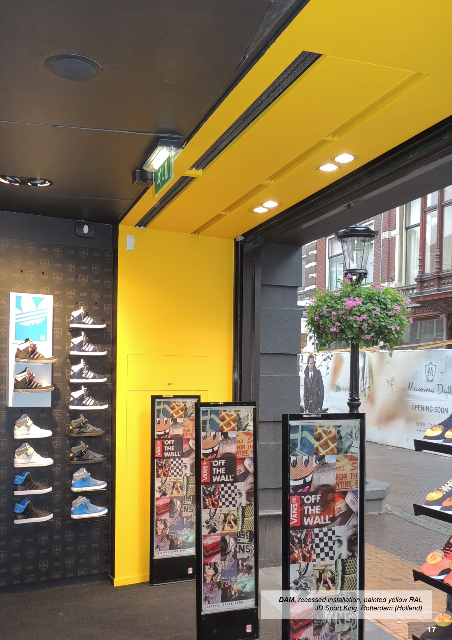
DAM, recessed installation, painted yellow RAL JD Sport King, Rotterdam (Holland)